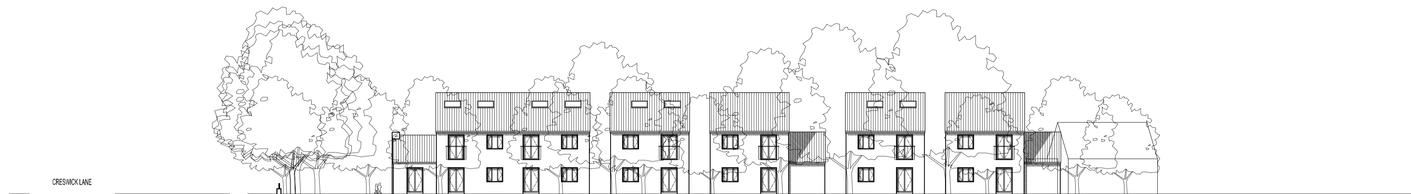
CONTEXT ELEVATION ON YEW LANE