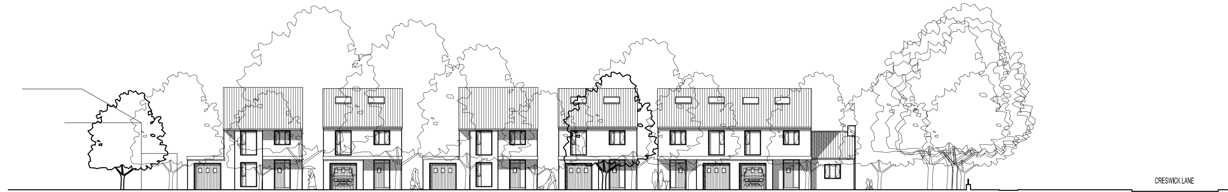
CONTEXT ELEVATION ON CRESWICK GREAVE